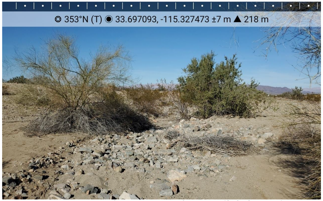
Photograph 4: View of unnamed drainage facing north (SoCalGas, 2022).