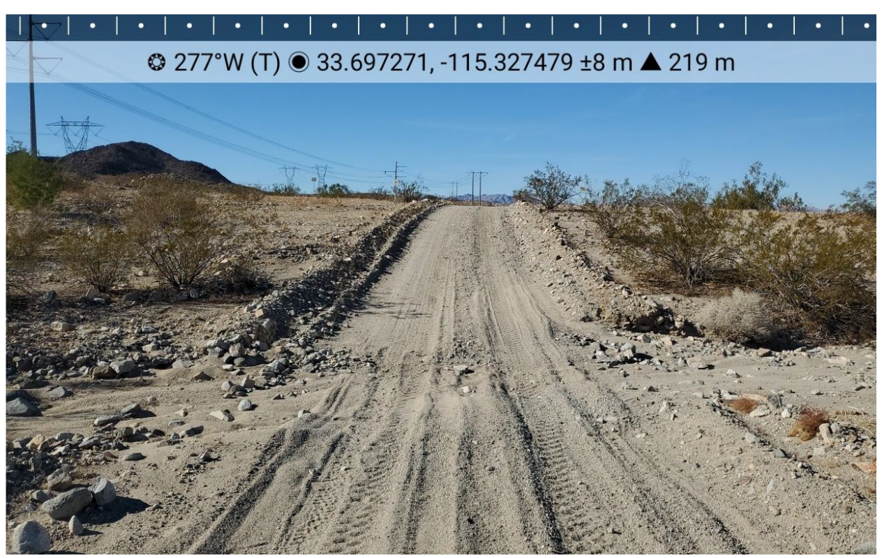
Photograph 1: View of access road with unnamed drainage facing west (SoCalGas, 2022).