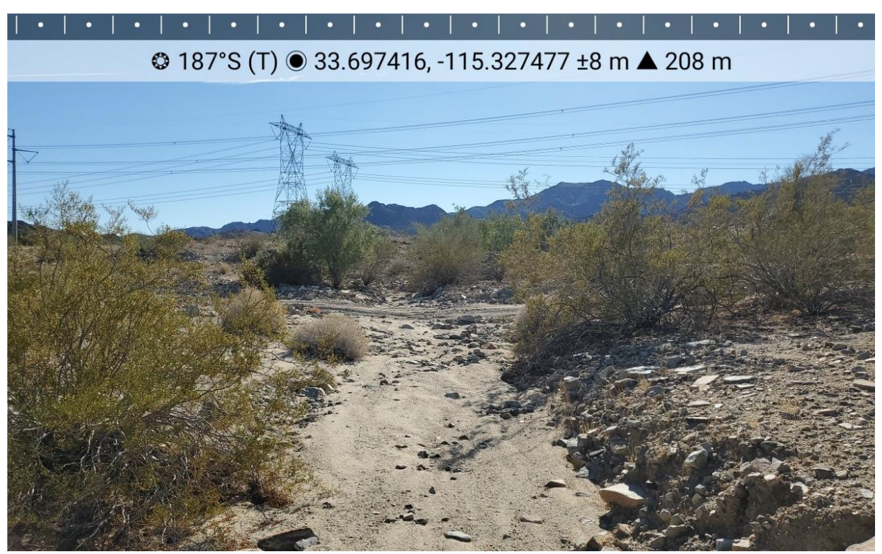
Photograph 3: View of unnamed drainage facing south.