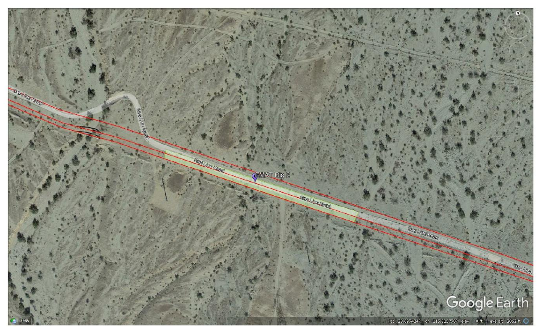
Figure 3: Line 2001/1030 EMAT 2 Location Map Riverside County (SoCalGas, 2022).