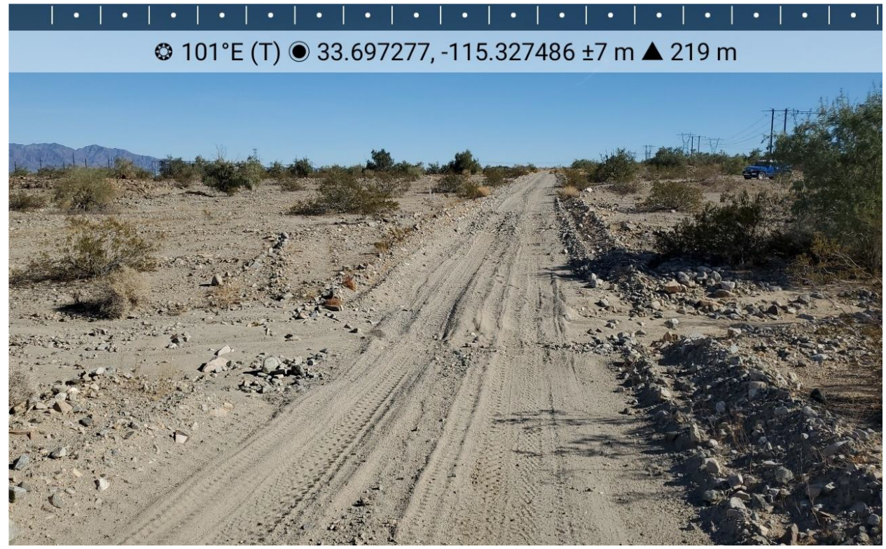
Photograph 2: View of access road with unnamed drainage facing east (SoCalGas, 2022).