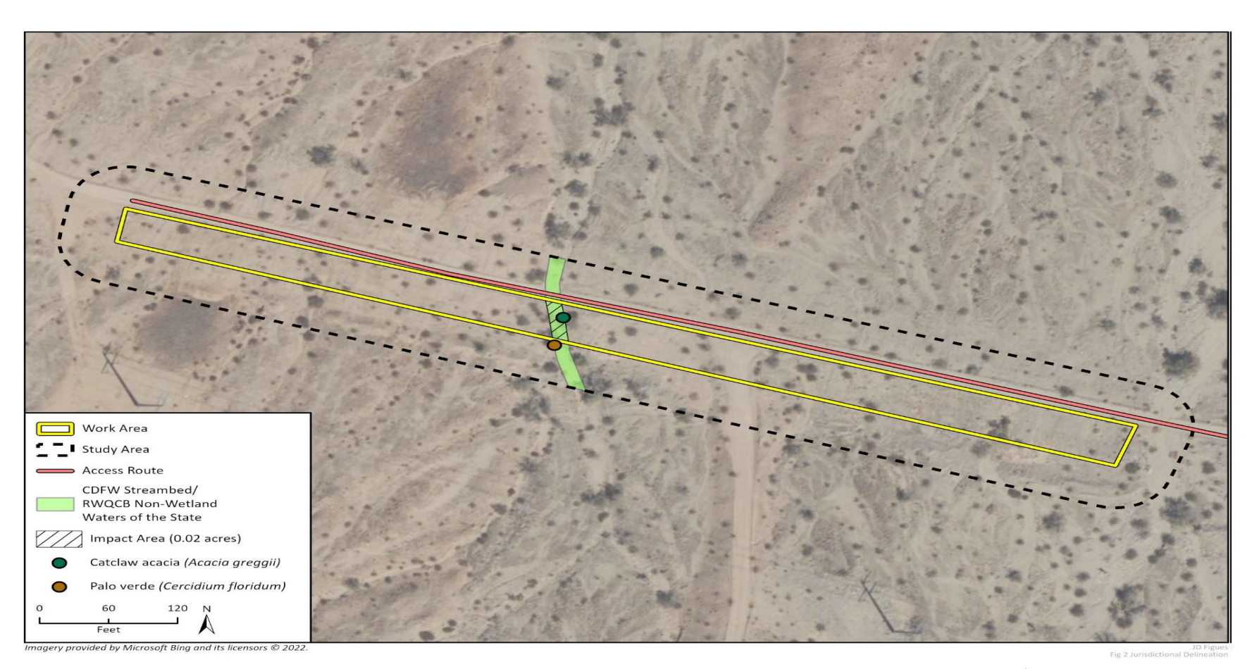
Figure 1: Project Area and Jurisdictional Delineation (SoCalGas, 2022).1

<sup>1</sup> Southern California Gas Company, February 2022. Notice of Intent (NOI) for the Southern California Gas Company Line 2001/1030 Pipeline Maintenance - Anomaly Repair/Replacement Project.